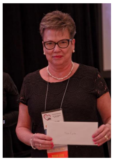
Accepting the ASTEF grant check